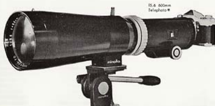
f5.6 600mm Telephoto*

*Manual pre-set lenses. All others are completely automatic.